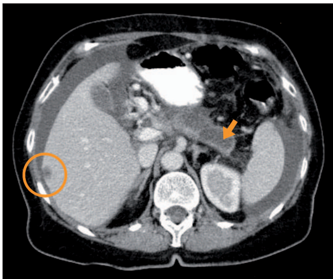
Figure 1. Abdominal-pelvic CT scan (axial section) showing a dilated main pancreatic duct that is occupied by a hypodense tissue structure (orange arrow) – suspected of IPMN involving the main duct – and a hepatic nodule in the right lobe (orange circle) suggestive of secondary lesion.

Due to later development of recurrent abdominal pain in the upper quadrants, persistent nausea and occasional vomiting for one month, she underwent digestive endoscopy and abdominal-pelvic computed tomography (CT). The esophagogastroduodenoscopy showed grade C esophagitis and congestive gastropathy with histological signs of active chronic gastritis and atrophy at antral mu-